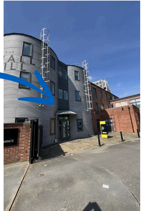
If the gate is not open you'll need to press the buzzer for 'Northpoint'