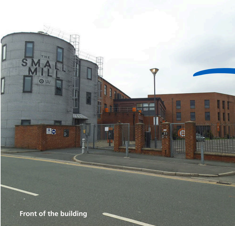
Front of the building

The Small Mill is near Leeds Dock, which is approximately 10-15min walk from the bus station, and 20 min walk from Leeds train station.