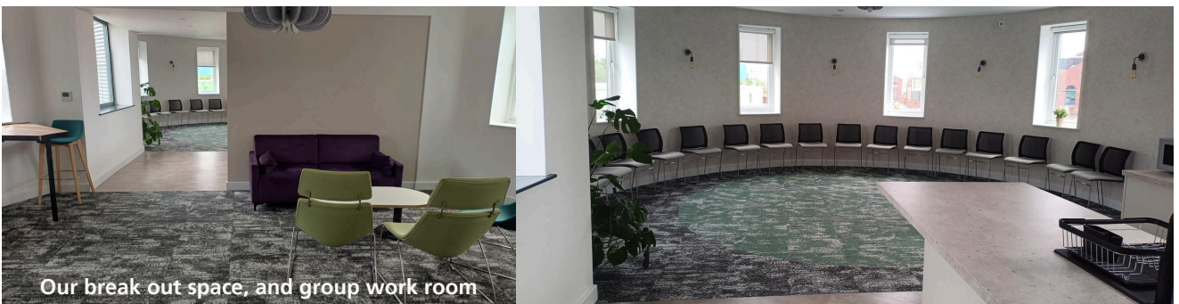
Our break out space, and group work room